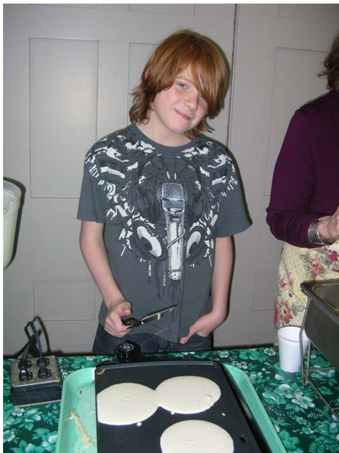
Cooking for the pancake breakfast.

The last Sunday for Sunday School will be May 30 th . Certificates and recognition of regular attendance will be presented on June 6 th .