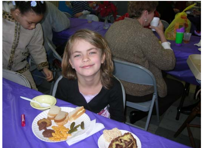
A happy diner!